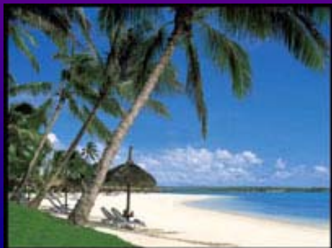
One of the many tranquil beaches on St. Kitts.